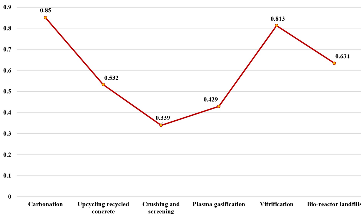
Fig. 3. Ranking values of the different alternatives

scores, respectively. These alternatives are not as sustainable or profitable in terms of revenue generation as carbonation and vitrification but are still promising in waste and pollution reduction. The lowest ranked alternative was crushing and screening with a score of 0.339. This process, although beneficial in certain uses, fared poorly in environmental impact and resource recovery potential, which accounted for its low ranking.